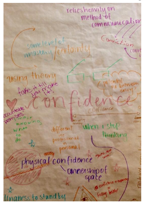
Figure 1. Mind Map

The mind map consisted of colours, statements, images, and other creative forms of expressions (see Figure 1). According to Butler-Kisber (2010) a collage is an effective tool because it is easy to use and quickly yields information that can help research participants overcome their fear and hesitation linked to participation because of perceived inability to draw or paint. Butler-Kisber writes that "collage evokes embodied responses and uses the juxtaposition of fragments and the presence of ambiguity to engage the viewer in multiple avenues of interpretation" (p.103).