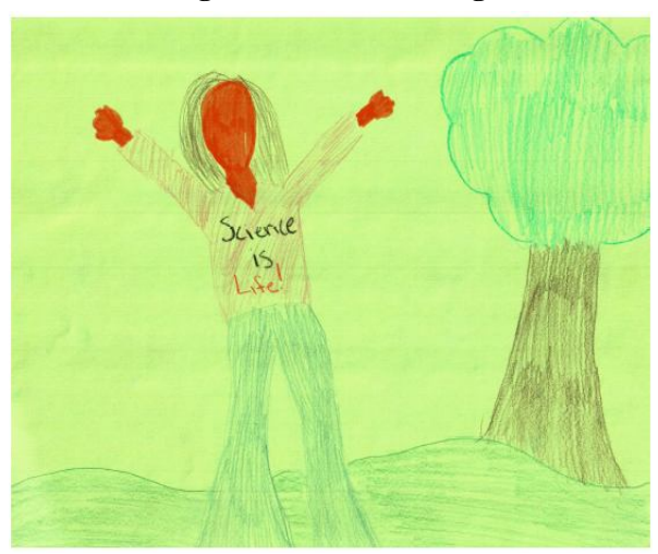
Figure 2. Post-Drawing

Finally, it was hypothesized that there would be a negative correlation between the STEBI and stereotypical depictions of science teachers (Table 6) -that is, students with strong efficacy will be less likely to portray science Teachers as stereotypical. Personal efficacy showed a small significant negative correlation with the DAST-P at both the pre and post administration times. However, the correlation was significant at the pre-test and no significant at the post test for outcome expectancy. Both the STEBI and DAST scales showed change from pre post; however, the relationship between the scales changed during the school term.